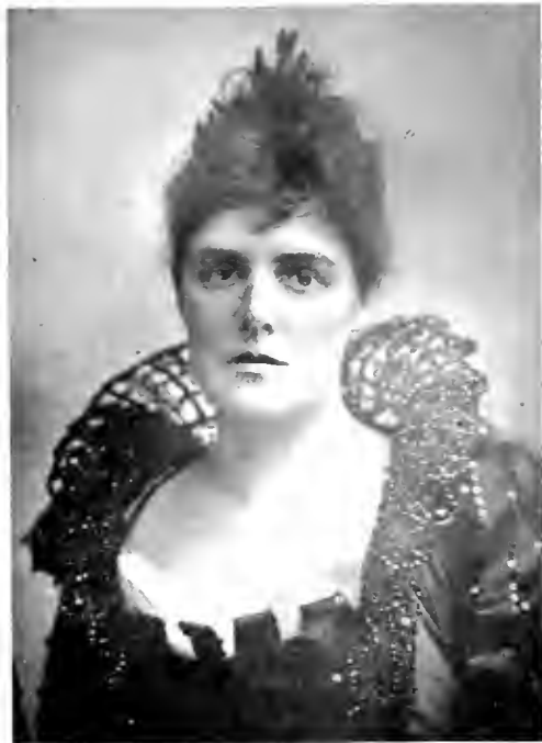
LADY RANDOLPH CHURCHILL.